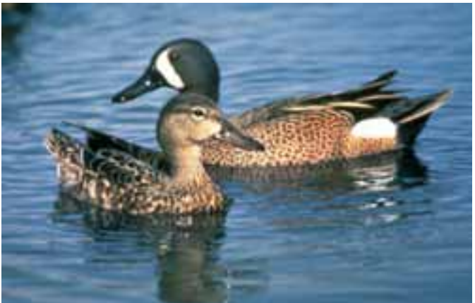
Blue winged teal

A portion of the refuge is managed for agricultural crop production through a cooperative farming program. By cooperative agreement, the farmer is required to leave a portion of each crop in the fields to provide food for wildlife. This crop share serves in lieu of cash rent for the farm ground. Wildlife are the beneficiaries at no cost to the refuge. The refuge share crops and crop residues provide high quality forage to accommodate the nutritional and energetic requirements of wintering waterfowl and other species of wildlife.