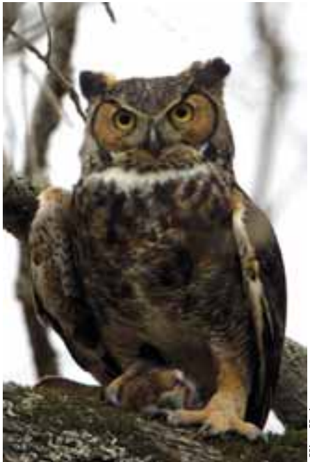
Great horned owl