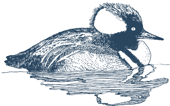
Male Hooded Merganser

The Patuxent Research Refuge offers rewarding opportunities for bird observation throughout the year. Late April through mid-May is the best time to observe migrating warblers. Waterfowl numbers are highest on the refuge during winter, but the greatest variety of waterfowl species are present in mid-March and mid-October.