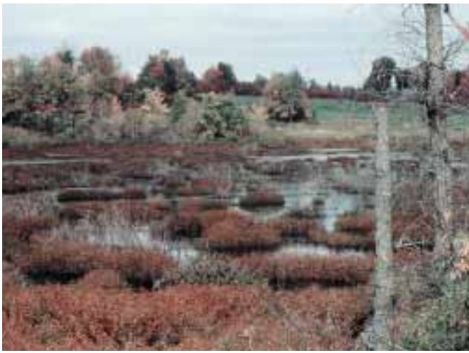
Beaver Creek Wetland