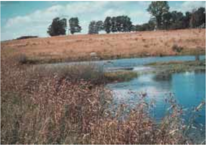
Wetland/Grassland habitat Restoration Project

experience habitat restoration sites, wildlife management, and demonstration projects that would be applicable on privately-owned land. In addition to the Headquarters area, the St. Lawrence WGMD has management responsibilities on three properties owned in fee title and 20 wetland easements.