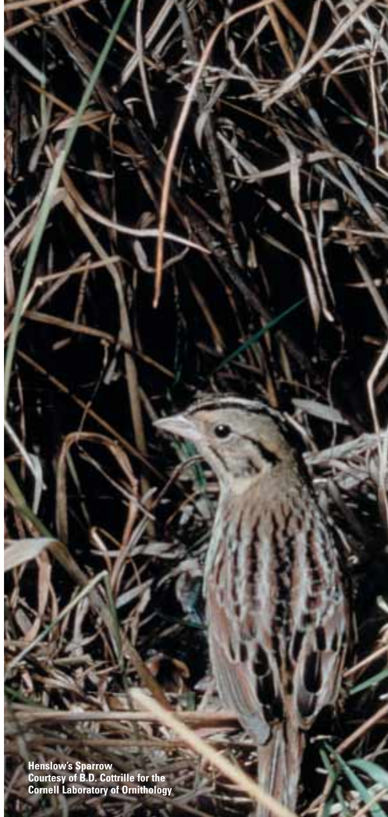
Henslow's Sparrow