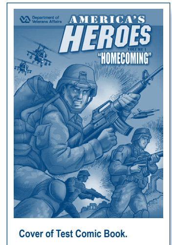
Cover of Test Comic Book.

Aimed at new veterans returning from Operations Iraqi Freedom and Enduring Freedom, the new comic book