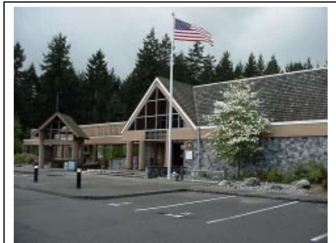
Olympic National Forest headquarters office in Olympia, Washington.

Take I-5 Exit 104 onto Highway 101. Drive 1.5 miles to Black Lake Blvd. and West Olympia exit. Take exit and then turn west (left) at bottom of exit ramp and drive under Highway 101 to second stop light. Office on right side of Black Lake Blvd.