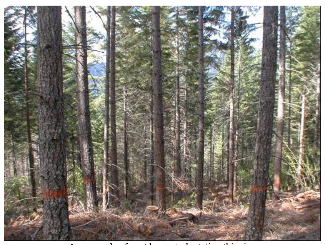
An example of post harvest plantation thinning

595 NW Industrial Way, Estacada, OR 97023