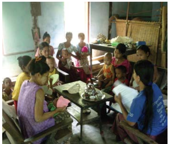
Focus group conducting surveys to identify needs in special populations.