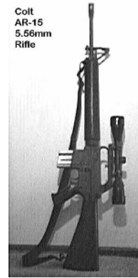
Colt AR-15 5.56mm Rifle

The highlight of these weapons was a Barrett semi-automatic .50 caliber sniper rifle (new in the box) with a long range scope, along with dozens of rounds of .50 caliber ammunition. The rifle and ammunition were transferred to the USMS Special Operations Group in Louisiana where it will likely be deployed in support of overseas missions. The Barrett is pictured in front of the Special Operations Group Tactical Center in Pineville, Louisiana.