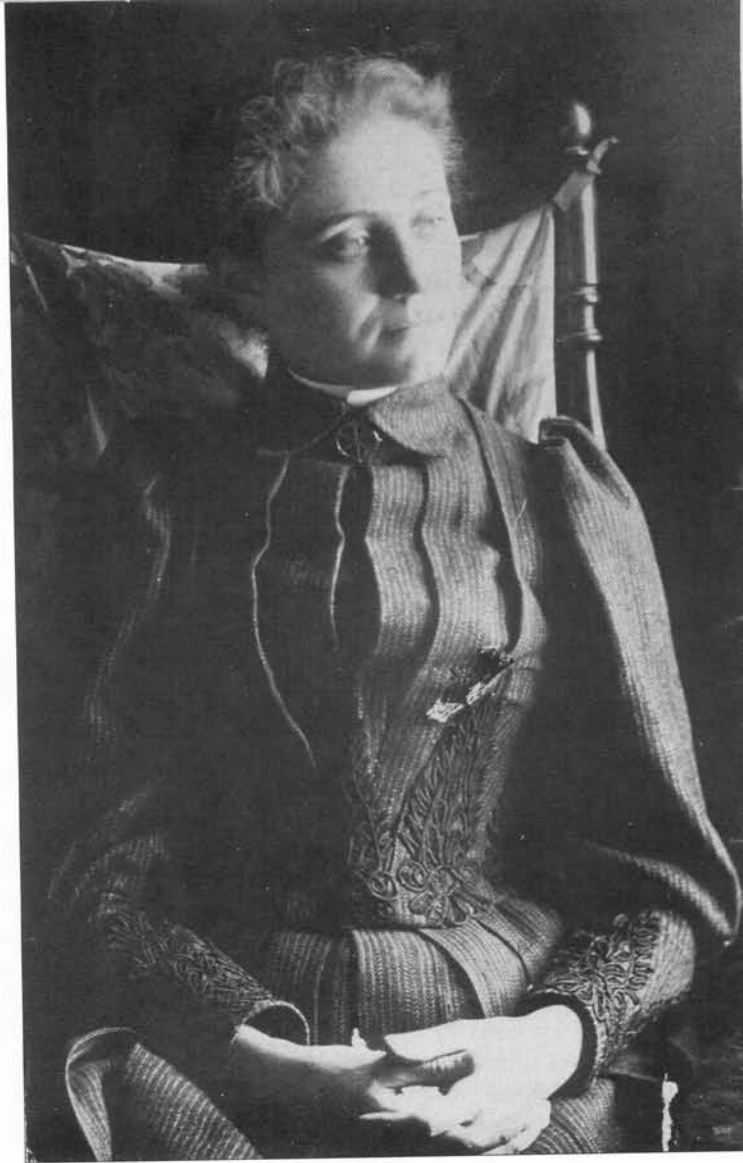
Jane Addams seated in a rocking chair at Hull-House during its first winter, 1889-90.

Everything from schools to canned goods has been named for her, and poems, plays,