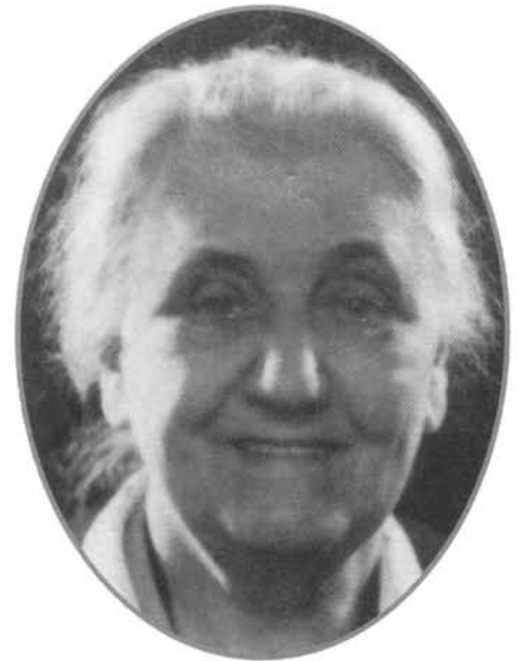
Portrait of Jane Addams

Subsequent volumes will cover Addams' response to World War I and explore her treatment as a leader in the American peace movement during the war, her leadership of the Woman's Peace Party and the Woman's International League for Peace and Freedom, and her dedication to the international woman's peace movement and world peace. In the three publications—the microfilm edition, the comprehensive guide for scholars, and the selected