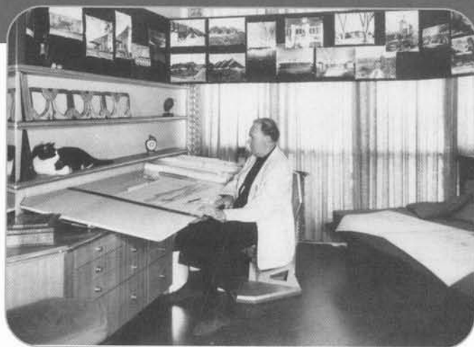
ABOVE: Bruce Goff with his cat, Cbiaroscuro , in his studio in Price Tower, Bartlesville, Oklahoma, 1962.

Because of the vast scope of the Bruce Goff Archive, the Art Institute divided the contents according to material type between four departments in the museum. The Department of Architecture holds Goff’s original architectural records and compositions; the Ryerson and Burnham Archives hold his books, personal and