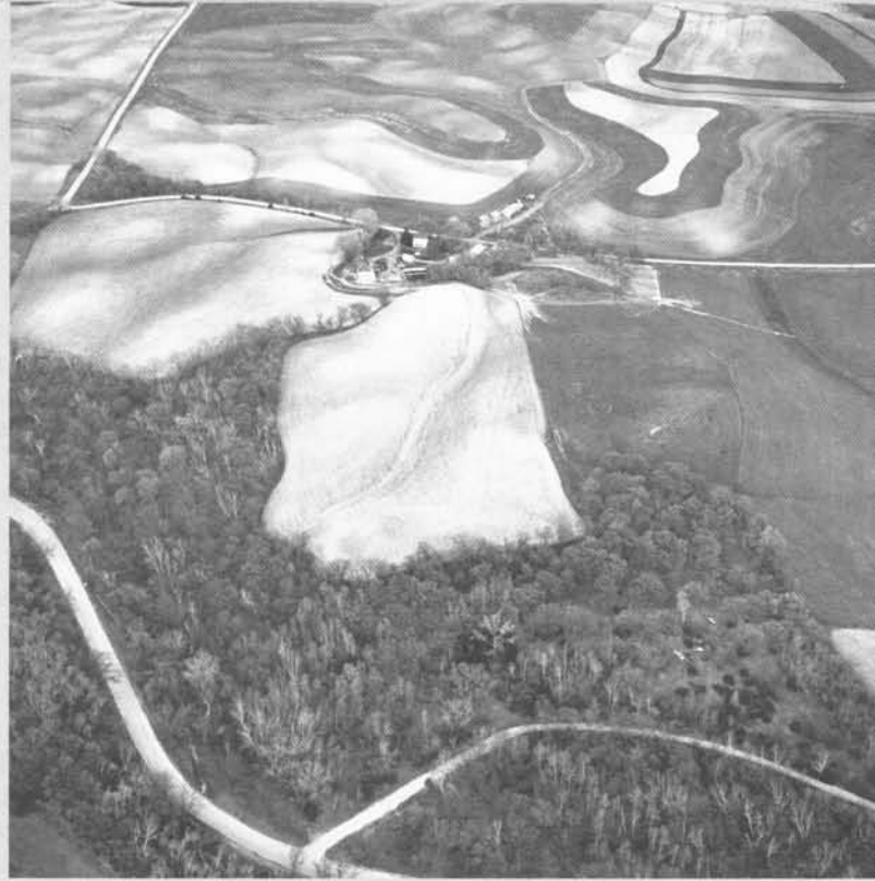
An aerial view of farmland surrounding a small farm in Dakota County, Minnesota, with forested hills in the foreground and gravel roads winding through the image.