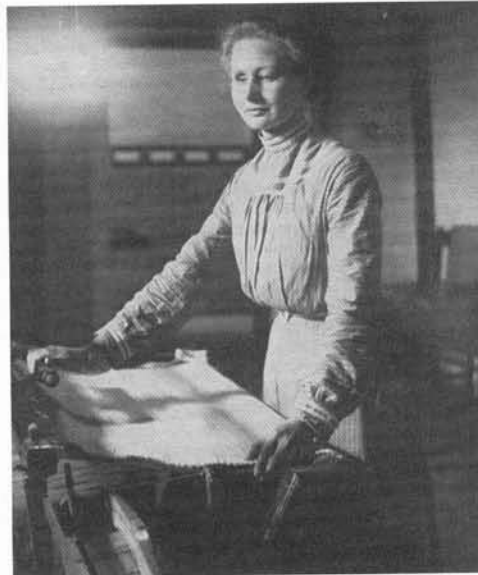
One of the first students at the Missouri School for the Blind is shown working at a process learned at the school.

Members shared the information they had gained in the MHRGP's archival training workshops, creating local 2-day workshops of their