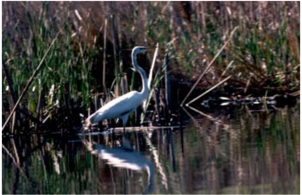
Despite its urban setting, the Grand Calumet River supports a diversity of fish and wildlife resources.

There is an ongoing effort to clean up the Grand Calumet River. Partners such as the Interior Department, U.S. Environmental Protection Agency, and State of Indiana are working to negotiate cleanup efforts among the parties responsible for polluting the river. One big step has already been achieved. In August 1998, the Department of Justice announced a settlement with USX whereby release of contaminants into the environment will be stopped and the eastern 5 miles of the Grand Calumet River will be completely dredged. The dredging project, at a cost of about $30 million to be paid for by USX, will completely remove the contaminated sediment from the riverbed and place it in a safe, sealed storage area. The U.S. Fish and Wildlife Service, with a focus on benefitting injured natural resources, was instrumental in expanding the original settlement to ensure that the dredging project completely removed contaminants that continue to affect fish, water quality, birds, and other resources.