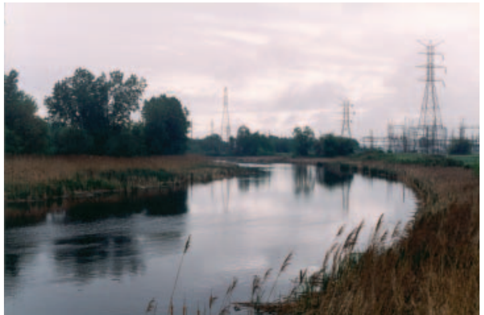
The Grand Calumet River traverses one of Indiana's most heavily industrialized areas. Clean up efforts are underway.

Traversing the area is the Grand Calumet River. Located about 15 miles southeast of Chicago, the Grand Calumet River watershed encompasses about 25 square miles in Lake and Porter counties, Indiana. Nearby is the National Park Service's Indiana Dunes National Lakeshore.