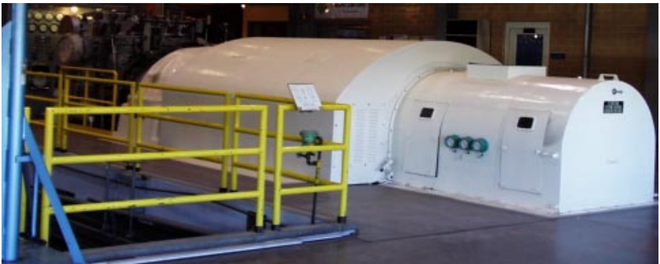
Figure 2. Turbine at the Main Power Plant.

The majority of the Laboratory's work is devoted to R&D activities. These activities vary in size, chemical use, and operating parameters. Furthermore, R&D activities occur at virtually all TAs within the Laboratory.