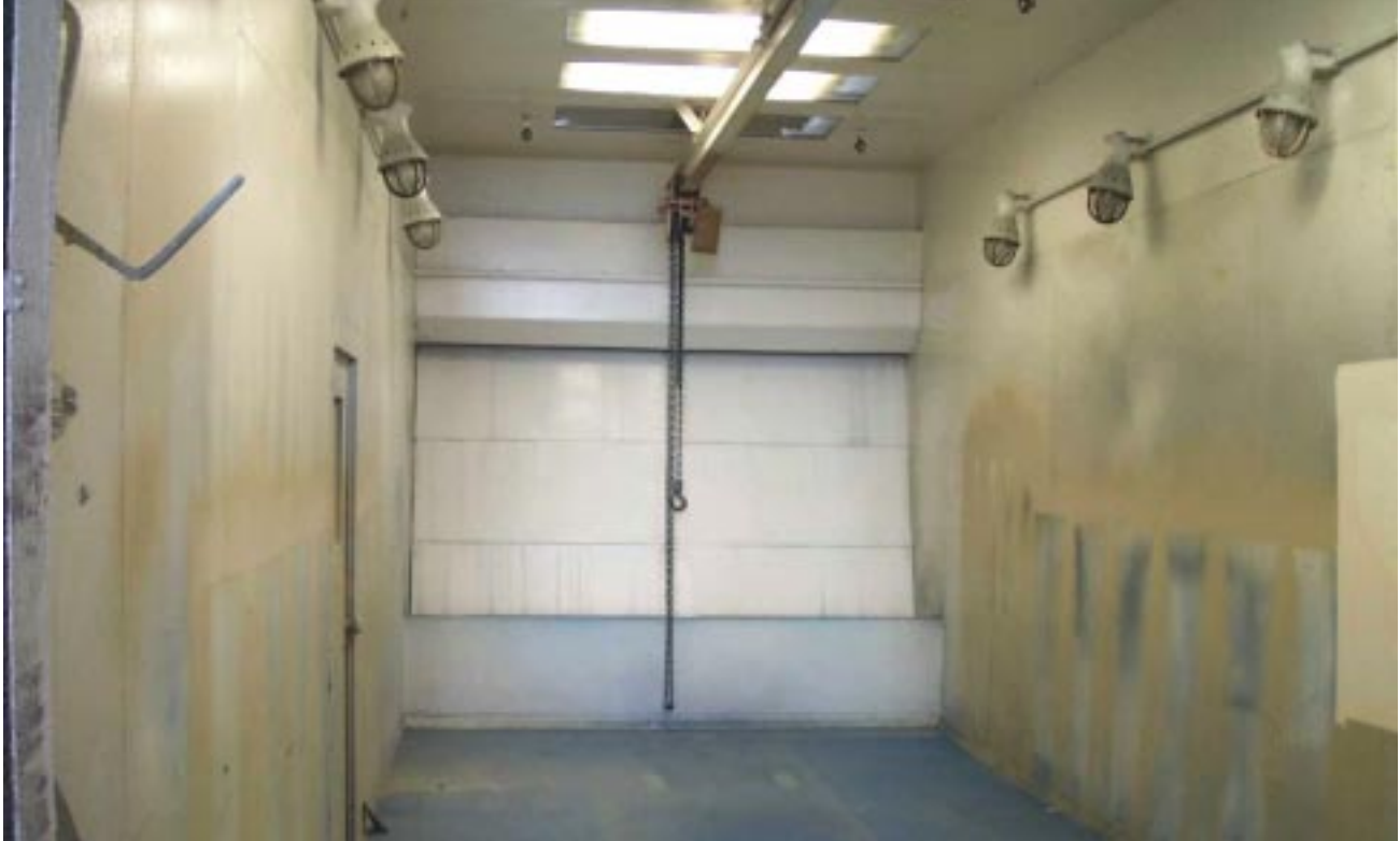
Figure 4. Paint Booth.

The Laboratory's reported emissions for 1997 are summarized in Table 1. The largest sources of regulated pollutants emitted at the Laboratory were combustion products from industrial sources. Three sources (Stack No. 005, 009, and 012) listed on the forms provided by the state have never been built or operated.