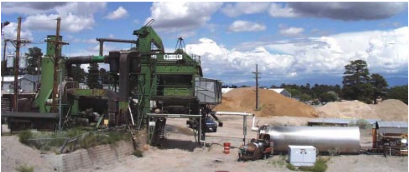
Figure 1. Asphalt Plant.

Power and boiler plant operations produce steam for heating and/or electricity when sufficient power from outside sources is not available. The Asphalt Plant, pictured in Figure 1,