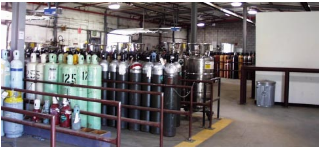
Figure 3. Gases ready for distribution within the Laboratory. The gases are tracked by the procurement record keeping.

The WOC database contained all JCNNM paint jobs and associated descriptions for calendar year 1997. Two hundred and one jobs were identified as being paint related. By using the job description field, a preliminary determina-