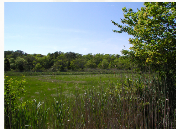
Manahawkin Marsh, NJ