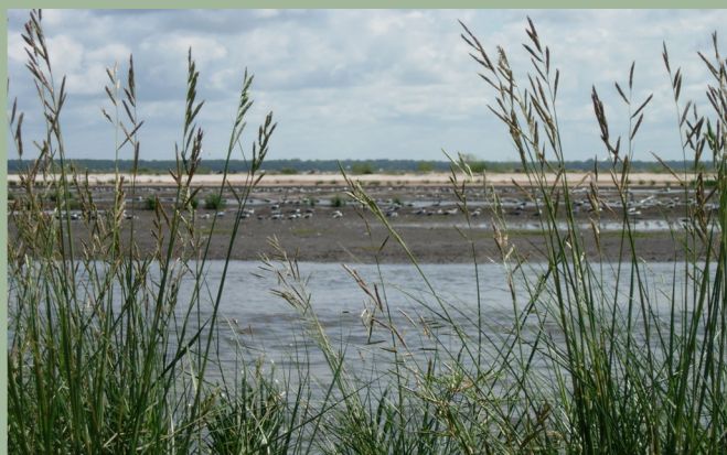
Deer Island, MS.

Coastal and estuarine areas are important both to humans and wildlife. These areas shield us from coastal storms, facilitate flood control, filter pollutants to maintain water quality, and provide access to waterfront areas for recreation. Our coasts also shelter fish and shellfish that are important to commercial and recreational fisheries. Coastal habitats provide nesting and foraging areas for coastal birds. These unique areas sustain numerous animal and plant species, including rare, threatened, and endangered species.