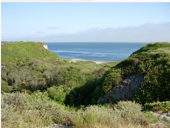
Sand Hill Bluff, CA