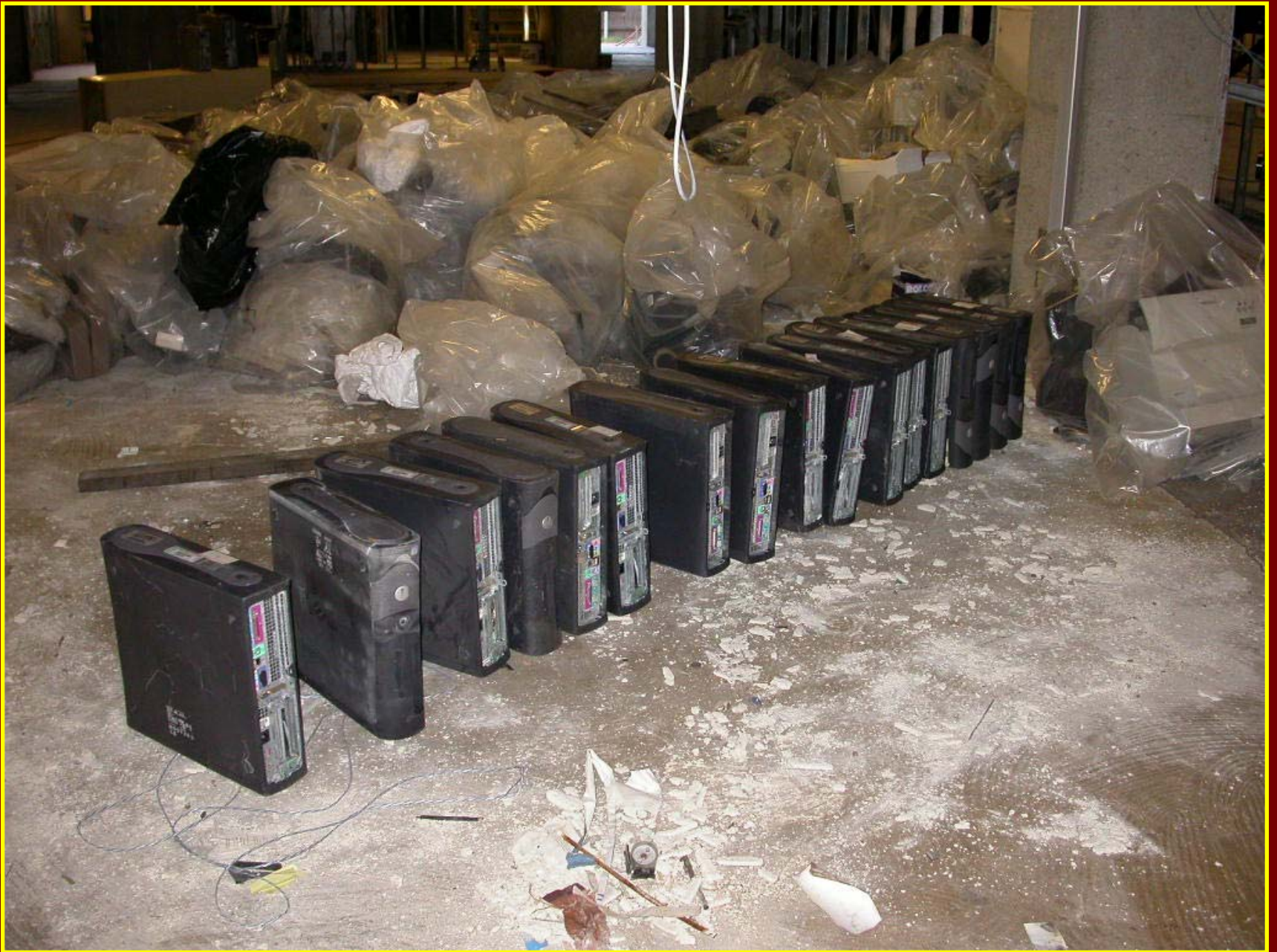
Computer records were also salvaged in this project