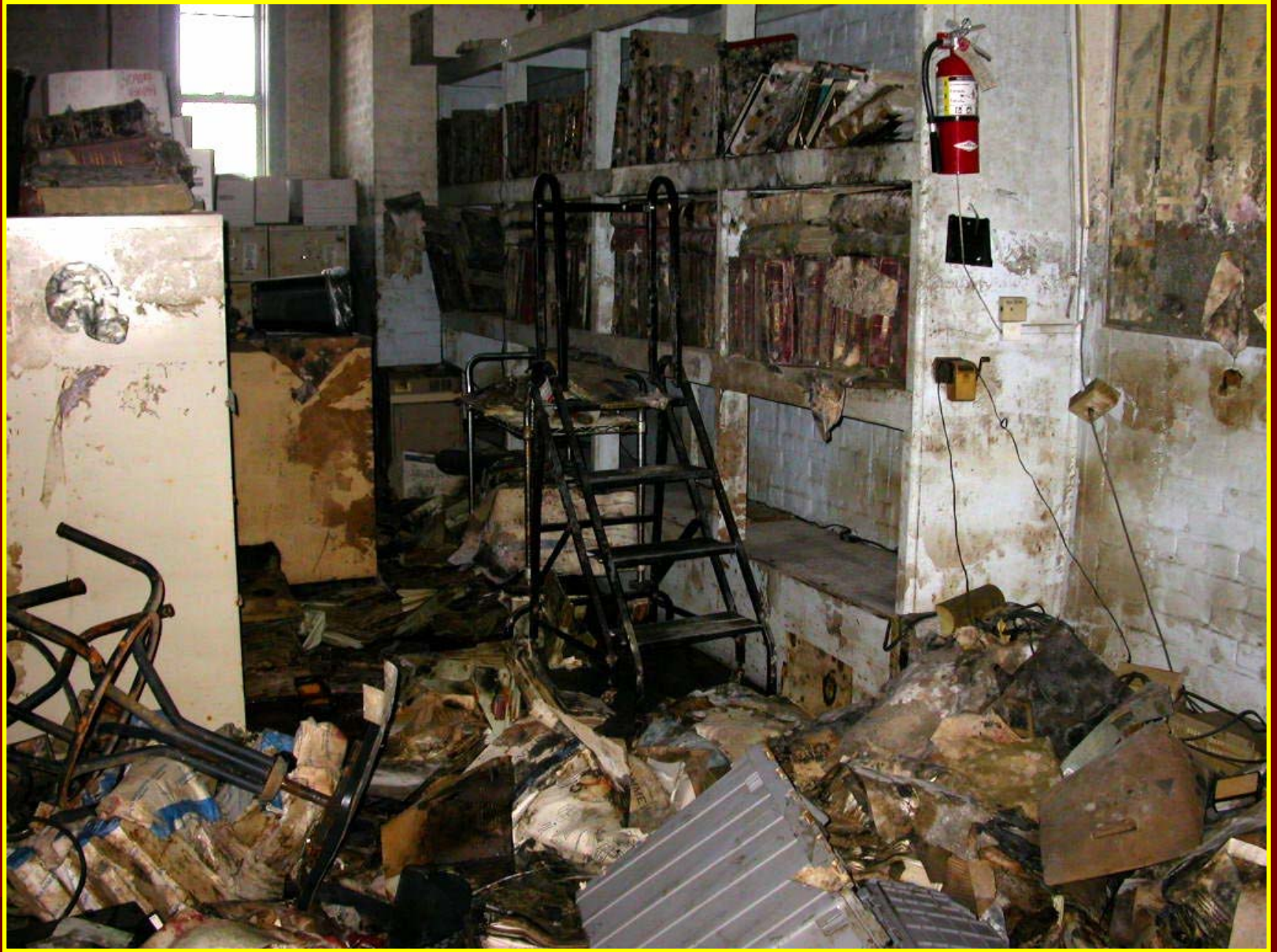
Wet or damp and very moldy records everywhere