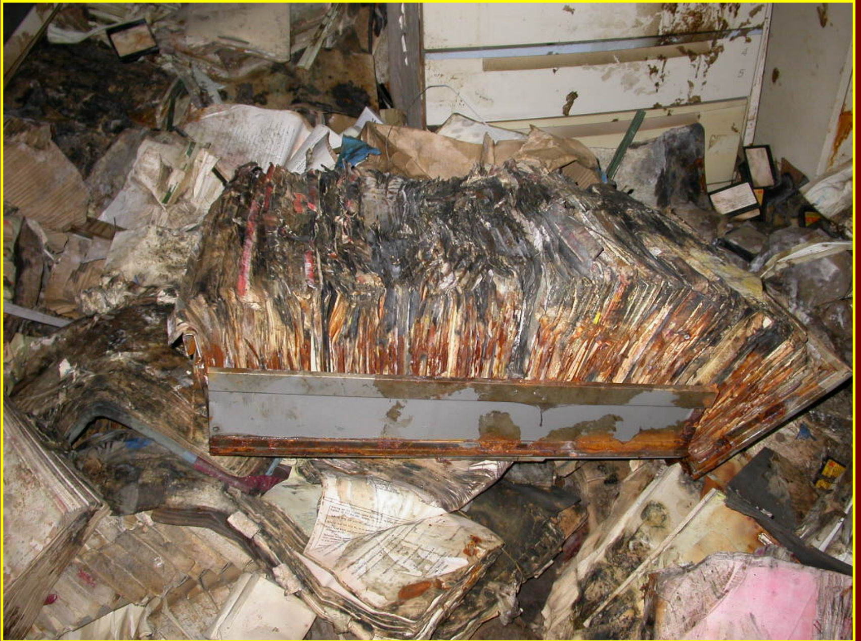
Records were often found in heaps