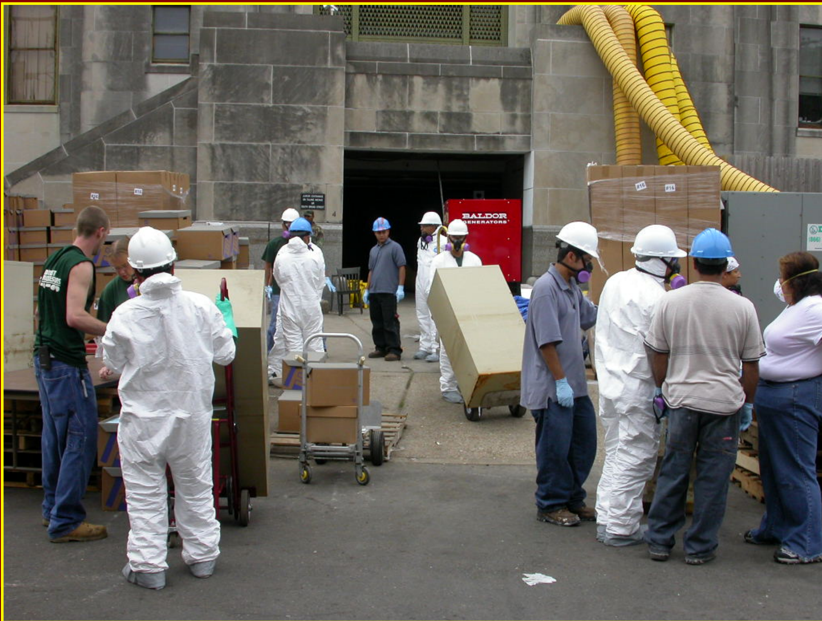
Contractor pulls records from Courthouse for triage.