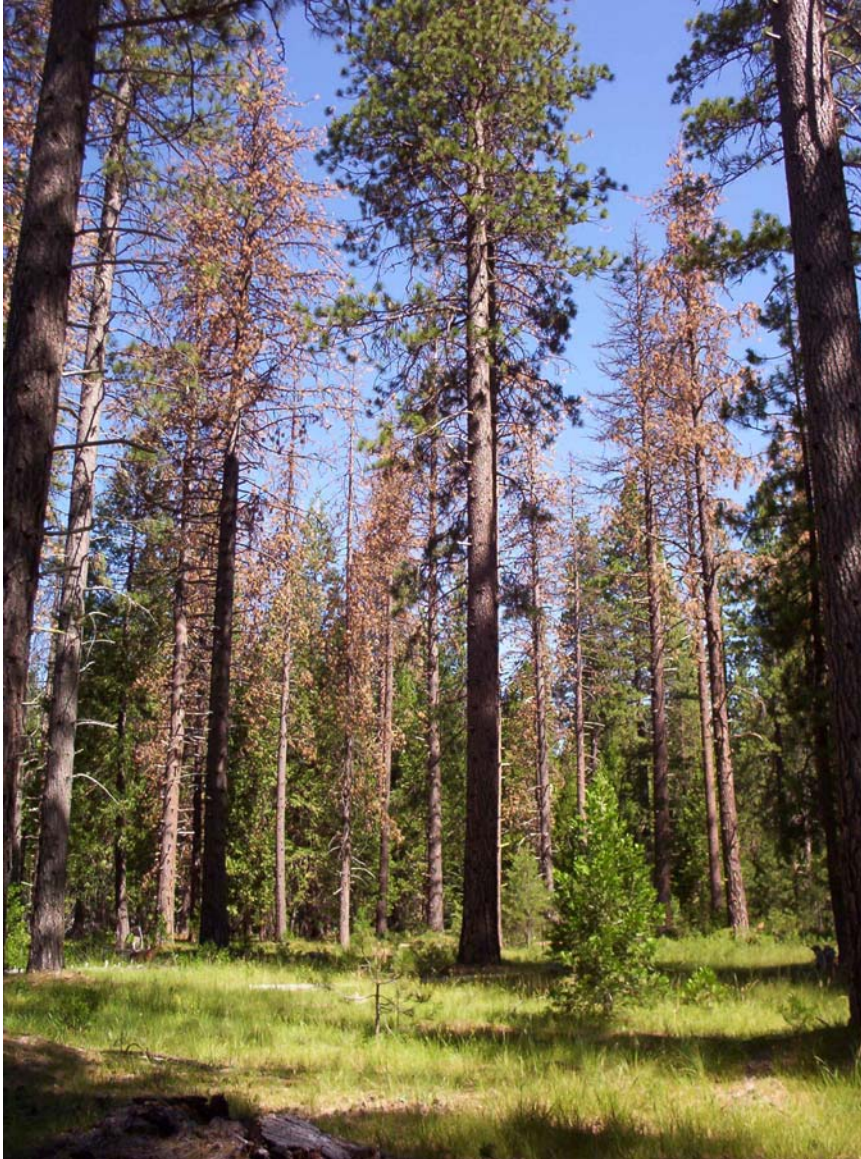
Photo 1. Trees weakened by root disease in harvest and replant areas are being killed by bark beetles. Mortality is approaching stand replacement levels with pockets of dead trees ranging in size from 1 to 5+ acres with up to 40 dead trees per acre interspersed throughout the entire stand area.