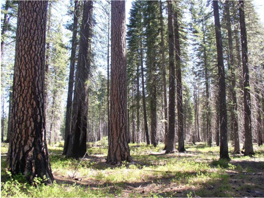
Photo 5. Desired Future Condition - Restore Elk Flat, retain larger trees.

Photo 4. This photo is an example of a Mature Stand Thin with an underburn, a few years post treatment. The proposed Mature Stand Thin units will look similar to this.