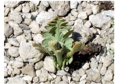
Pumice grape fern ( Botrychium pumicola )