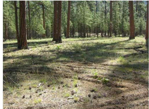
Cone collectors damaged portions of the Metolius RNA. FS employees spent a day trying to repair damaged areas.

FY 2008 Goal: Establish an RNA Team to improve our management of these special areas.