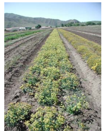
Sulphur-flowered buckwheat in cultivation at FS Lucky Peak Nursery, 2007.