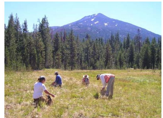
Collecting high elevation bottlebrush squirreltail ( Elymus elymoides ) for future revegetation projects, Bend/Ft. Rock District, August, 2007.

FY 2008 Goal: Host a Regional Revegetation Training to learn techniques in the new Roadside Revegetation Manual written for Western Federal Highways by our Regional Revegetation Team. The techniques can be applied to all types of disturbed habitats.