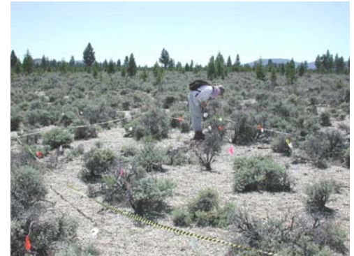
Andrea Raven (Berry Botanic Garden) installing plots to monitor effects of grazing on pumice grape fern, summer 2007.

FY 2008 Goal: Continue pumice grape fern grazing monitoring.