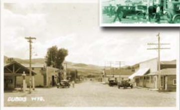
Early Dubois photos

The rich western history of Dubois includes the stories of Shoshone guide, Togwotee, Jedediah Smith, Jim Bridger, and later, Butch Cassidy. A memorial west of Dubois pays tribute to the era of the famous "Tie Hack" the men who handcut railroad ties.