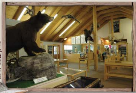
Dubois Museum photos