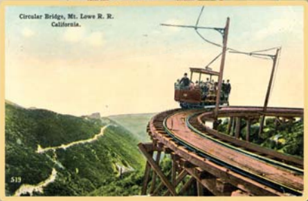
Postcard of the Circular Bridge, circa 1900s.