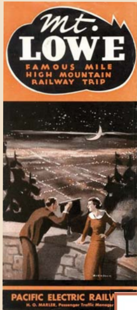
Inspiration Point brochure, circa 1920s.

Civil War hero, pioneer balloonist, famous inventor were but a few of Professor Lowe's earlier accomplishments.