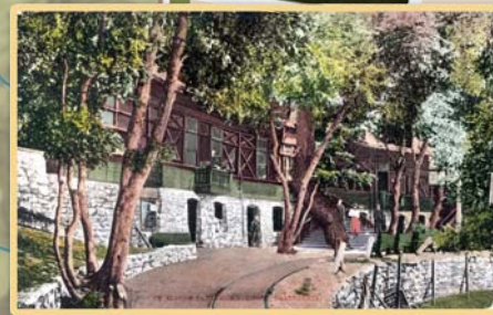
Alpine Tavern postcard and above brochure, circa 1900s.

Destination point of the vertical railway, the Echo Mountain Hotel was one feature of the "White City" which spread out on the summit of Echo Mountain.