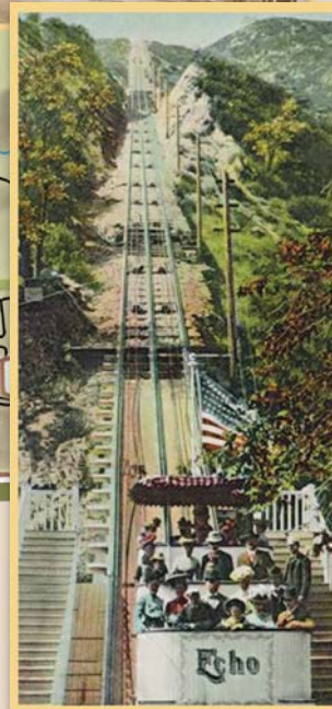
Postcard of the vertical railway on Mt. Echo, circa 1900s.