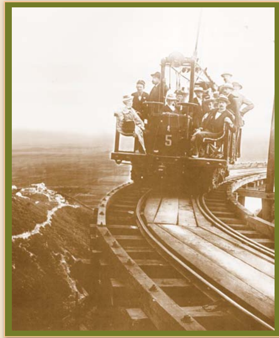
Passengers on electric car No. 5 swing out on the Circular Bridge over the Las Flores Canyon enroute to the Alpine Tavern, circa late 1890s. The White City atop Echo Mountain can be seen in the background left.