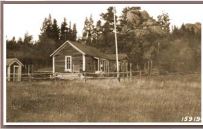
South Pass Ranger Station, 1921. Is this still there..if not, where was it located?

This pass played an important role in western expansion. First noted by William Hunt's expedition (1811) to Astoria, Oregon, it was rediscovered 12 years later by the Smith-Ashley fur trapping convoy. Used sparsely before the discovery of gold in California (1848) by 1868 over half a million had crossed South Pass on the Oregon Trail heading westward in search of gold or lands to homestead.