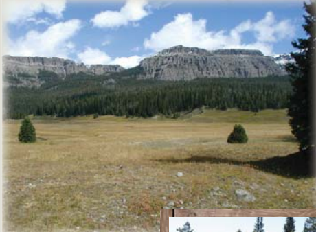
Dundee Meadows above is a spot to ride or hike to on the DuNoir Trail.