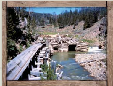
Flume and splash dam at Warm Springs Creek