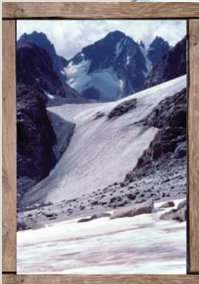
Elsie Col glacier, maybe a paragraph about the glaciers that are in the Wind River Ranger District? The DuNoir glacier is in this area, could use a photo of the DuNoir here if we have it, etc.