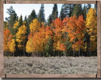
Aspen ablaze on the road to Double Cabin.