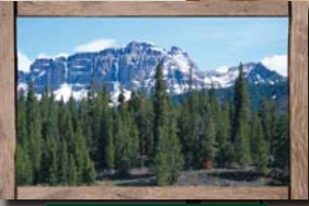
Pinnacles at Togwotee Pass