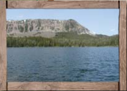
View across Pelham Lake