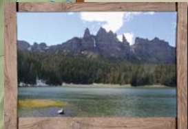
Mountain view from Kisinger Lake

How Were the Falls Formed? Brief explanation of how these falls were formed text text and more text to enlighten and inspire for sure. Continuing brief explanation of how these falls were formed text text and more text to enlighten and inspire for sure.