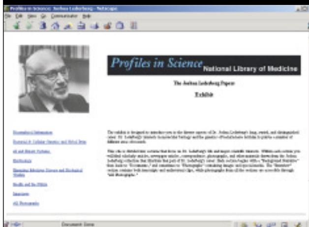
Figure 2. Sample exhibit page in the Profiles in Science system.

of the attachments is likely no longer accessible.