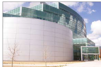
National Security Sciences Building