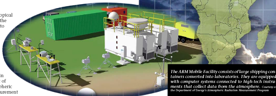
The ARM Mobile Facility consists of large shipping containers converted into laboratories. They are equipped with computer systems connected to high-tech instruments that collect data from the atmosphere.

ARM scientists will collaborate with researchers from the University of Hohenheim as part of the long-term Convective and Orographically-induced Precipitation Study, or COPS. Information obtained during COPS should improve regional weather forecasts to help protect people and land, and help