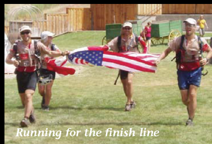
Running for the finish line