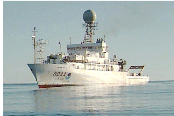
Figure 1. The C-band radar atop the central mast of the Ronald H. Brown research vessel.