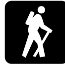
Table Rock Feather River Ranger District