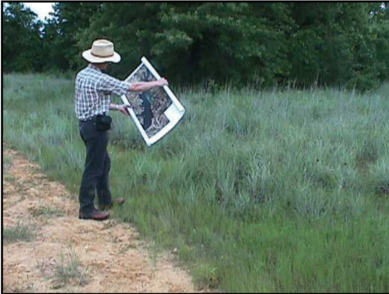
Figure 9. Level One Inventories of a Special Status Species should be initiated by delineating the project area where the species is likely to occur.

within one or more broad cover types (Figure 9). The following hypothetical example is provided.