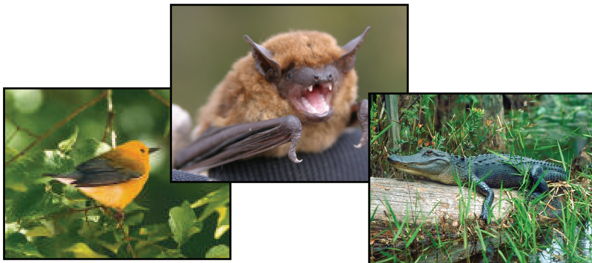
Figure 8. Broad-based inventory methods are available for many species and communities.