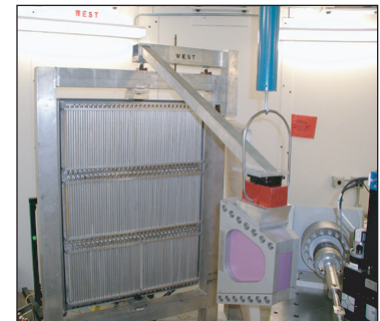
"Short" radial collimator supported between load frame and detector.