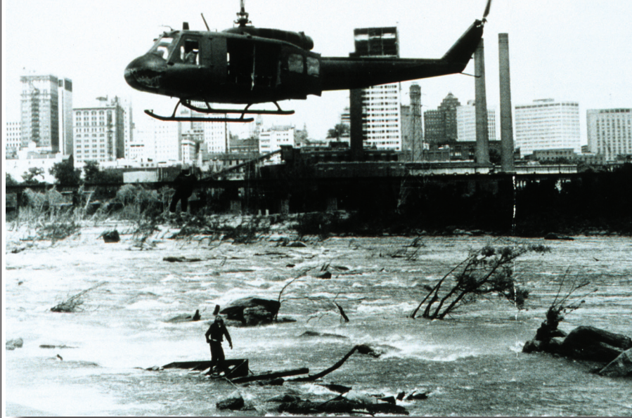
Virginia National Guard helicopter rescuing an individual from the James River. Note: rescued man halfway up to helicopter. Helicopter crewman standing on debris in river.

"Fifteen years ago, storms battered the West Coast of the United States...There were droughts in Australia, Indonesia, and India...Worldwide, 2,000 people died...Economic losses amounted to billions of dollars...In Indonesia and Borneo, dry conditions fed raging forest fires that consumed hundreds of thousands of acres. Smoke blanketed the area..."