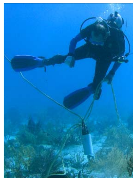
Jim Hendee of AOML untangles Kevlar-covered PAM fluorometer cables before weighting the power canister to the ocean bottom.