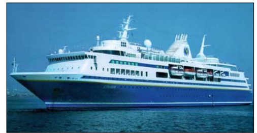
The ship Explorer is now part of the fleet of volunteer observing ships that assist AOML in deploying Argo floats and surface drifters throughout the world's oceans.

The international Argo program has a goal of deploying 3,000 free drifting profiling floats over the global oceans by 2006. The VOS fleet is an important component of this undertaking. Data collected by Argo floats provide continuous monitoring of circulation and climate patterns in the oceans on a global scale. NOAA is one of the chief participants in implementing the ocean-sensing Argo array. The Argo array is part of NOAA's Global Climate Observing System/Global Ocean Observing System housed at AOML within its Physical Oceanography Division.