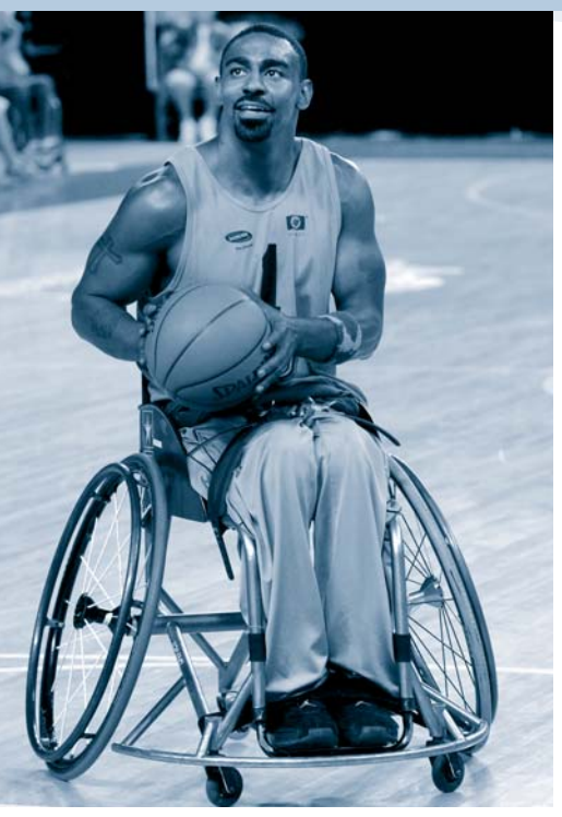
National Rehabilitation Special Event 2006