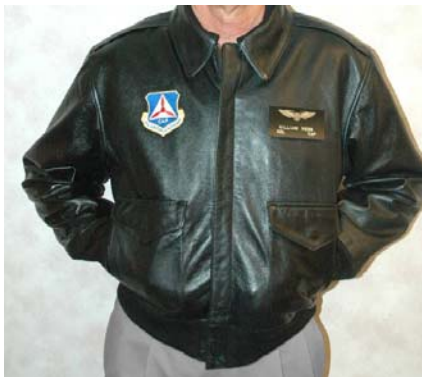
CAP Leather Jacket