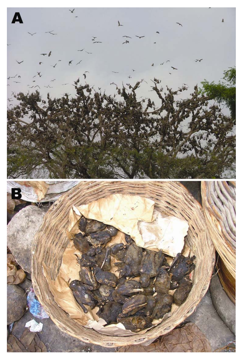
Figure 2. A) Density of a typical Eidolon helvum roost in the Accra colony. B) E. helvum as bushmeat in an Accra market.