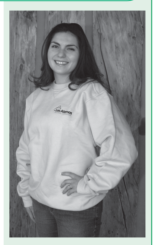
This white long-sleeve sweatshirt with the Laboratory logo sells for $35 and also is available in black and beige. Golf shirts, hats, and coffee mugs are also available.

French said that ARAMARK accepts personal checks and credit cards for Laboratory logo merchandise.