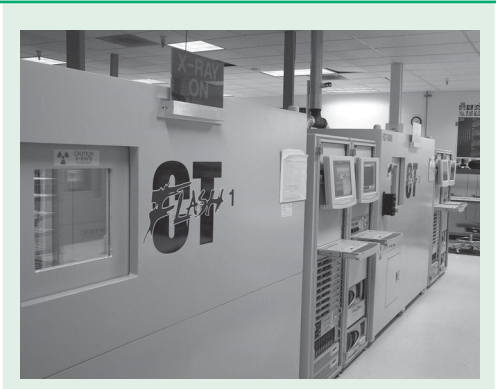
The Flash CT, built by Hytec, is a 3D tomography system used for model-based engineering and nondestructive inspection.

IBD has also been actively involved, along with the Los Alamos Commerce and Development Corporation, in the development of the Los Alamos Research Park.