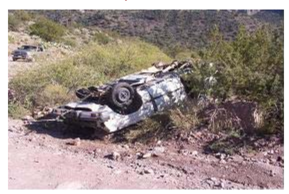
An average of 40 vehicles are abandoned each year!