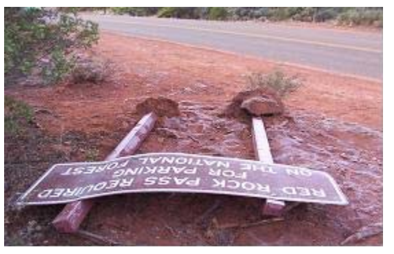
An average of 400 signs are replaced each year!