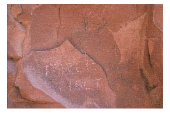
Graffiti, a growing impact requiring immediate attention!