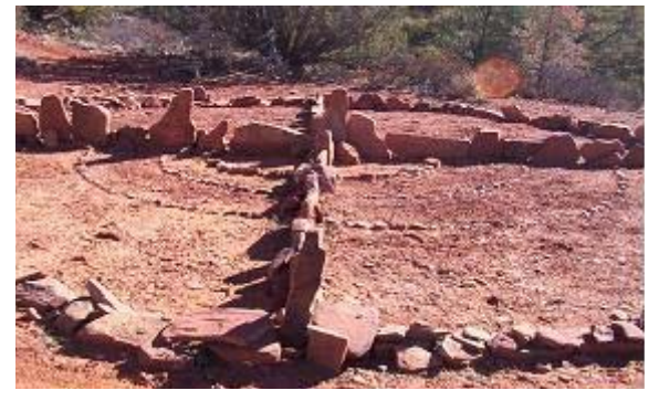
Removing medicine wheels, a continuous impact!

Forest Clean Up Supported by Red Rock Pass Revenue