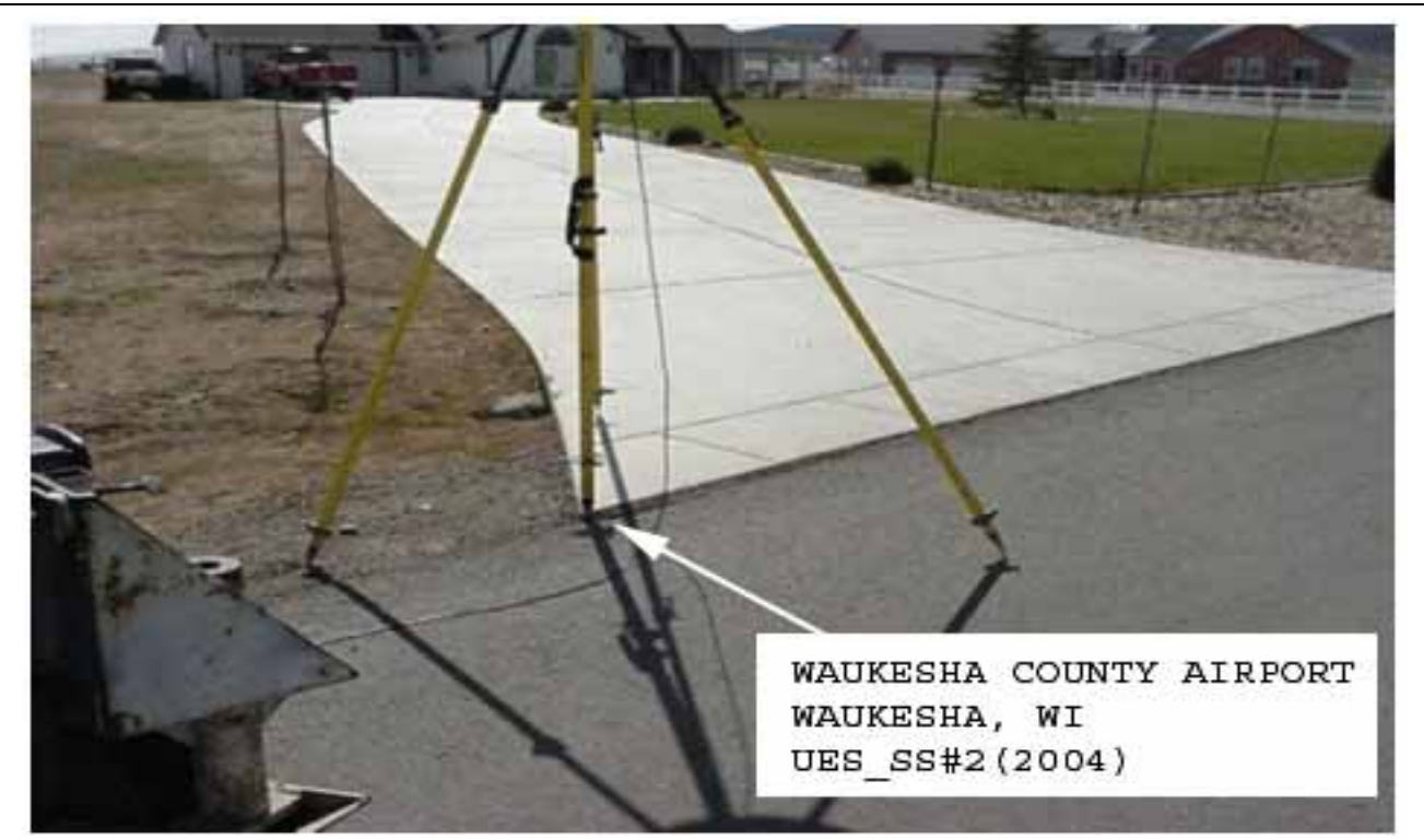
Figure 1 shows a sample digital photograph of an imagery control point with the antenna located over the point. Note the caption has been added to the photo to aid in identification of the point.

Document each image control station using the FAA Station Location and Visibility form (available at <a href="http://airports-gis.faa.gov">http://airports-gis.faa.gov</a>). Include on the form a sketch of the area surrounding the control point and a digital image of the control point and the surrounding area. In the sketch area of the form, list the file name used to identify the appropriate digital image for the station being described on the form. Complete a separate form for each control point.