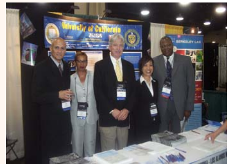
Pictured Above: Small Business Advocates during the DOE 6th Annual Small Business Conference last June.

To find out more information about the listed events, please visit http://business.lanl.gov/eventscalendar.shtml .