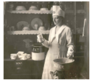
RG 4, NARA's Southeast Region