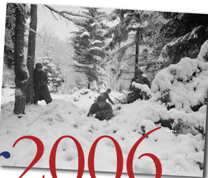
Exhibit: National Personnel Records Ctr. Archival Programs Division St. Louis, MO The Battle of the Bulge Old Ordnance Room/Jefferson Barracks Runs through November 5, 2006 Wed.-Sun. Noon to 4:00 p.m. 314-544-6224 / 314-544-5714 American infantrymen of the 290th Regiment fight in fresh snowfall near Amonines, Belgium, January 4, 1945.

Citation: RG 111, NARA's Still Pictures Branch