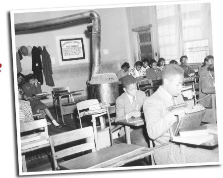
Classroom, c. 1951

Exhibits: Mid-Atlantic Region Philadelphia, PA Education in Black & White Around the World With the USS Olympia