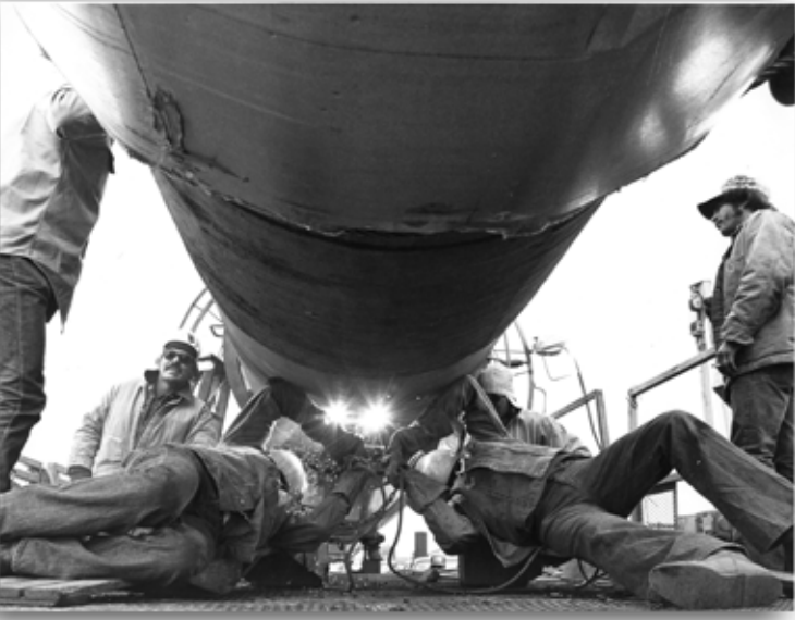
Welders complete final weld for the Trans-Alaska Pipeline, May 30, 1977.

Tensions in the United States between protecting the environment and finding new sources of energy had a major impact on