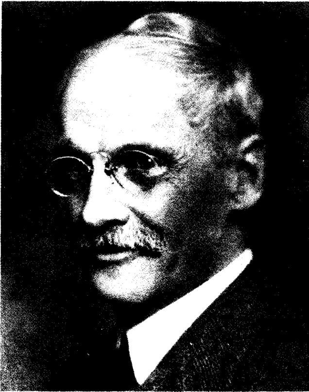
FIG. 14. Charles L. Minor

ago. When such changes occur in such short a time it is evident that only by constant growth and by adaptation to new conditions arising constantly, can medical men and medical societies hope to keep abreast of the times." Minor reminded the members that the study of tuberculosis had taken a large place in the work of the Association, and the future historian of the antituberculosis campaign in the United States could not ignore what had been done by the members of the Climatological. The Climatological was the first society to pay special attention to the subject. Valuable papers on climatic treatment, careful studies on the use of tuberculin, pioneer work on nomenclature and classification later taken up by the National Association, important papers on early diagnosis by x-ray and on pneumothorax, and many others strongly influencing the development of an interest in tuberculosis in this country could be found in the Transactions .