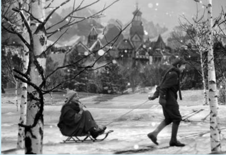
Children's film still from The Snow Queen, screening on January 3 and 4

3 SATURDAY Children's Film 10:30 Film The Sign of the Cross (eba)