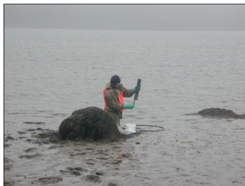
Maine Yankee Nuclear Power Plant (former), Wiscasset - see case highlights.