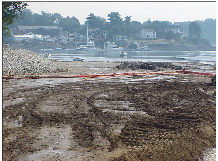
Portsmouth Naval Shipyard, Kittery - see case highlights.