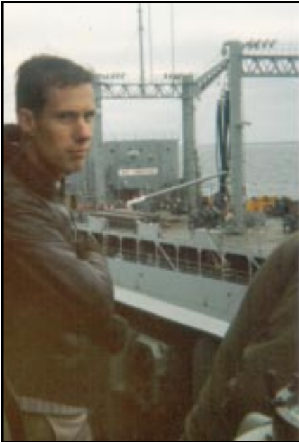
Lautenbacher family photo

Lautenbacher recalled, “I watched the ship come in filled with 350 Vietnamese refugees. I walked onboard and helped with continued on page 5