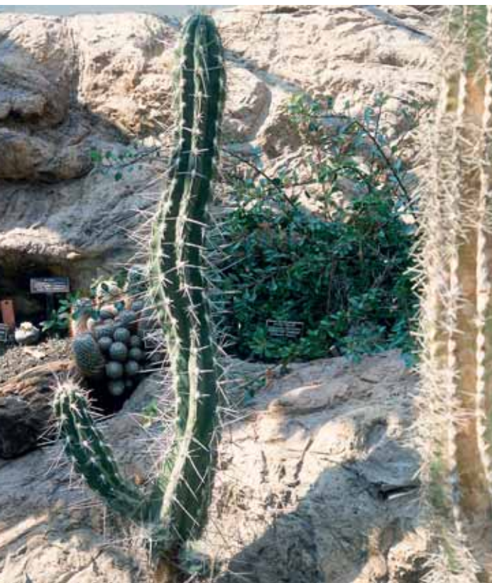
(ABOVE AND CENTER) CAM PLANTS.

All plants must take in carbon dioxide ( \text{CO}_2 ) in order to have the carbon needed for photosynthesis. This intake is done through tiny pores in the leaves called stomata. In most plants the stomata open during the day to take in \text{CO}_2 and give off oxygen and moisture. To conserve moisture, however, most desert plants, like the saguaro (at right) and other cacti have a slightly different photosynthetic process called CAM (crassulacean acid metabolism). The stomata on CAM plants are closed during the heat of the day and open at night. The \text{CO}_2 is taken in, converted to malic acid, and stored until daylight, when it can be transformed into sugar, the end product of photosynthesis.