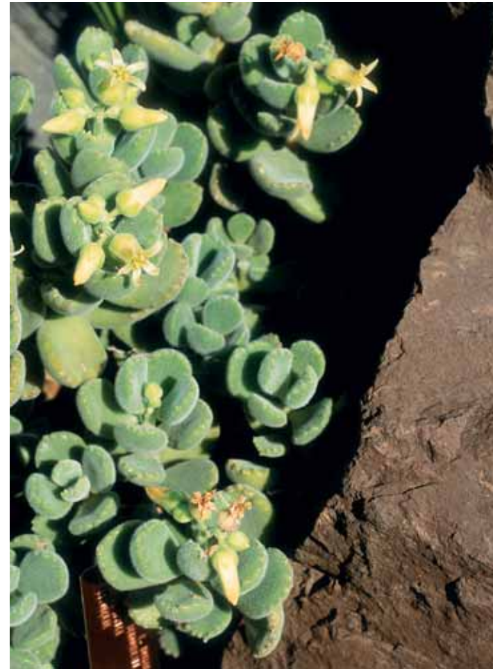
(ABOVE) BEAR'S PAW ( Cotyledon tomentosa ssp. ladismithiensis ).