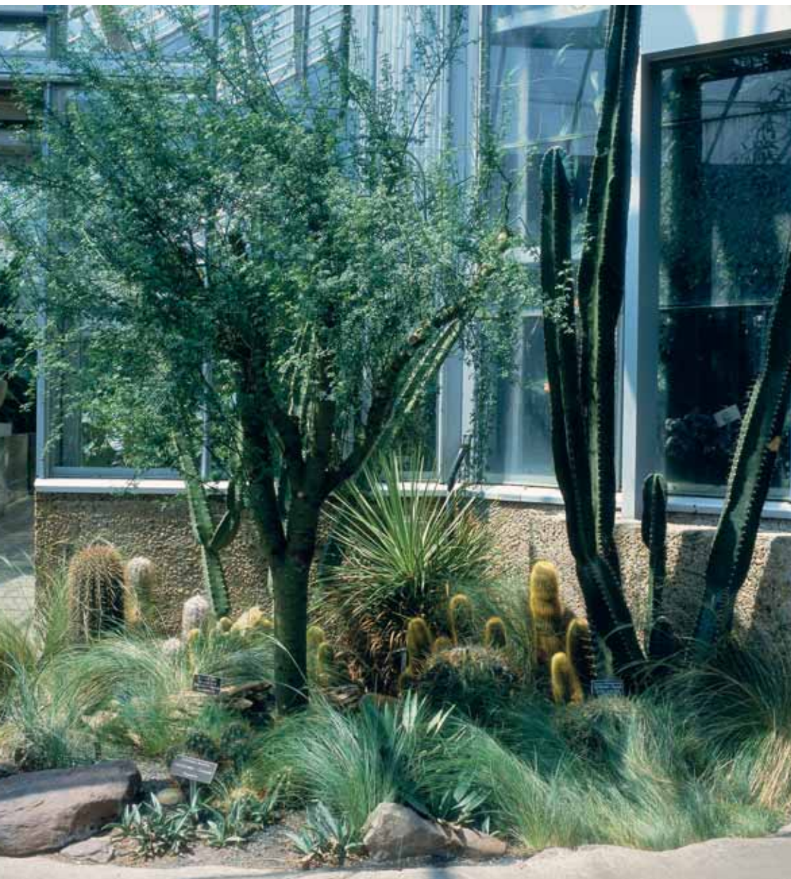
(ABOVE) BLUE PALO VERDE ( Parkinsonia florida ).