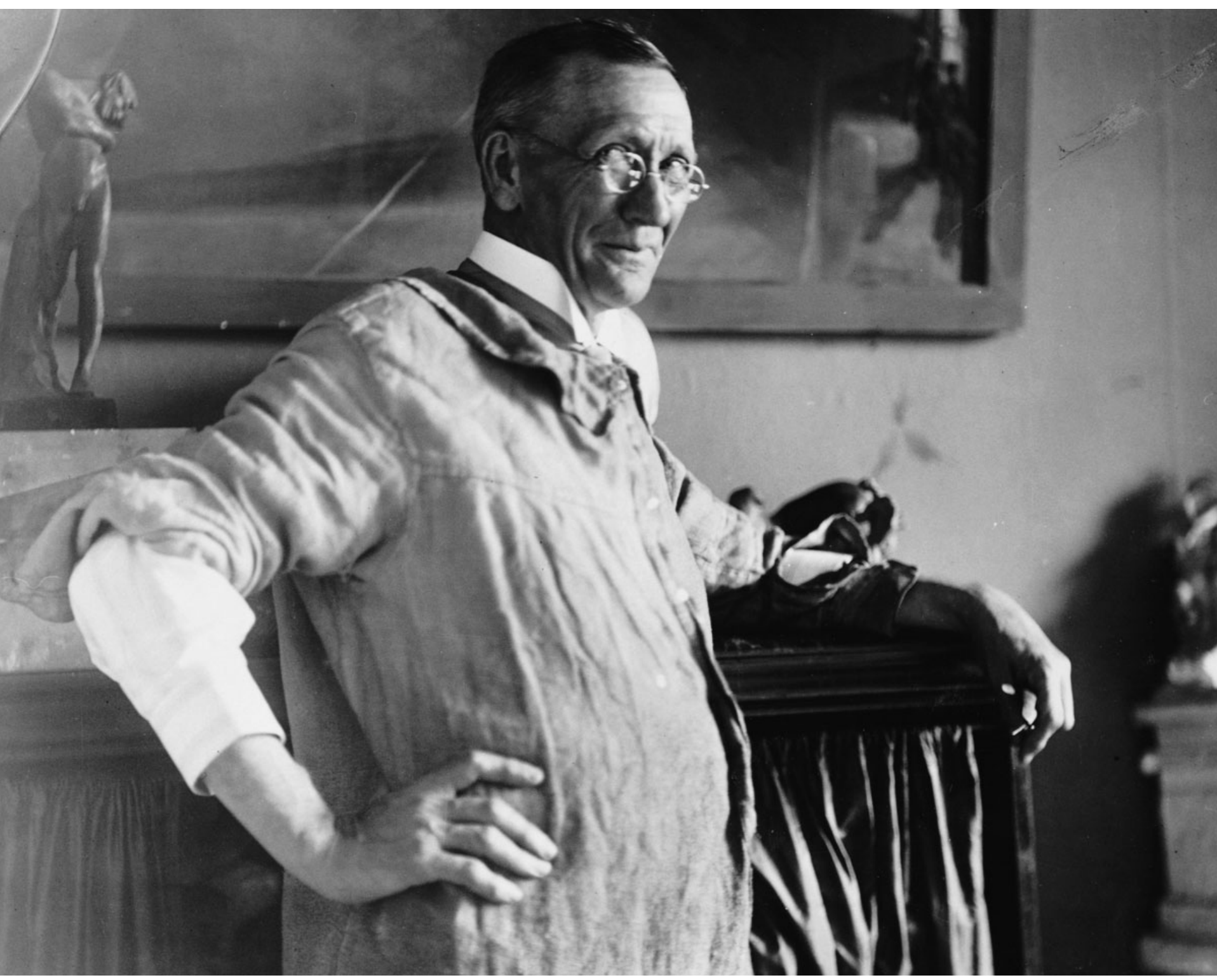
Sculptor Charles Niehaus was renowned for his mastery of the human figure. (Architect of the Capitol)