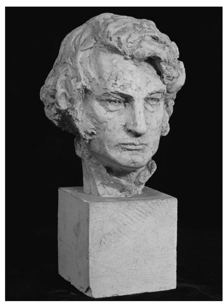
The plaster model for the bust of Chief Justice Roger B. Taney by Augustus Saint-Gaudens.