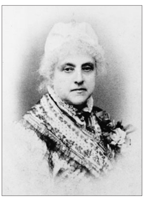
Delaware native, Civil War nurse, and sculptor Sarah Fisher Ames. (Architect of the Capitol)

In 1860 Lincoln was elected the nation's first Republican president. By the