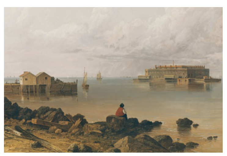
Fort Lafayette, New York by Seth Eastman, 1870–1875. (House Fine Arts Board. Photo courtesy Architect of the Capitol)