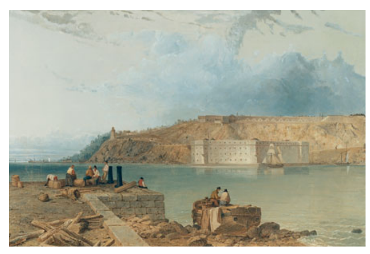
Fort Tompkins and Fort Wadsworth, New York by Seth Eastman, 1870–1875.

(House Fine Arts Board. Photo courtesy Architect of the Capitol)