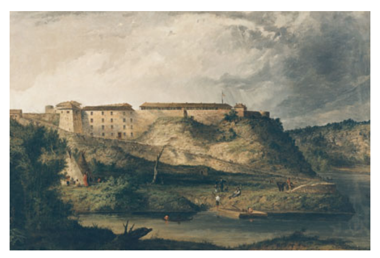
Fort Snelling, Minnesota by Seth Eastman, 1870–1875. (House Fine Arts Board.)