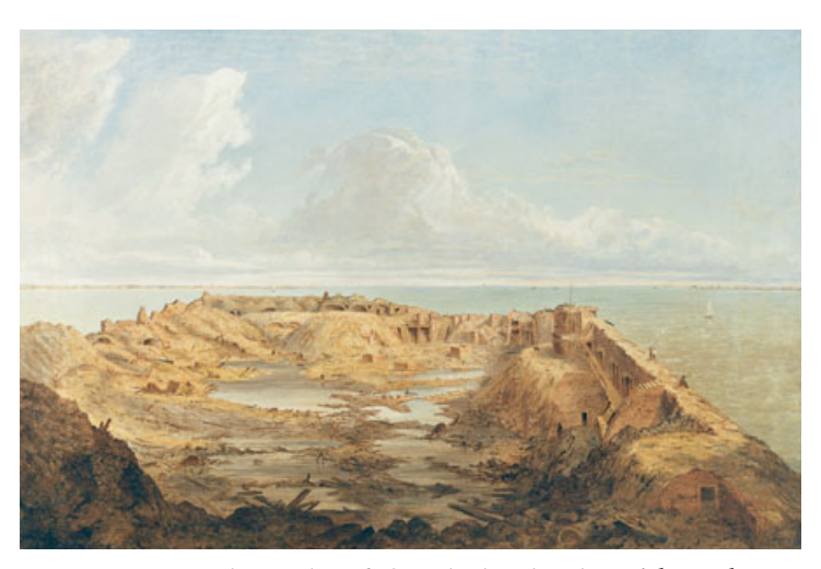
Fort Sumter, South Carolina (after the bombardment) by Seth Eastman, 1870–1875. (House Fine Arts Board. Photo courtesy Architect of the Capitol)

(House Fine Arts Board. Photo courtesy Architect of the Capitol)