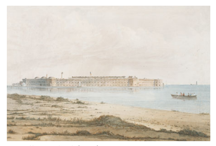
Fort Jefferson, Florida by Seth Eastman, 1875. (House Fine Arts Board.)