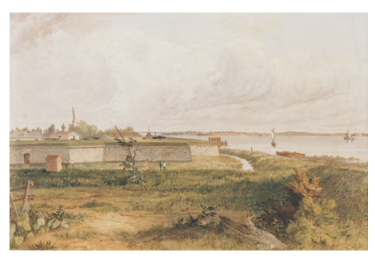
Fort Mifflin, Pennsylvania by Seth Eastman, 1873. (House Fine Arts Board. Photo courtesy Architect of the Capitol)