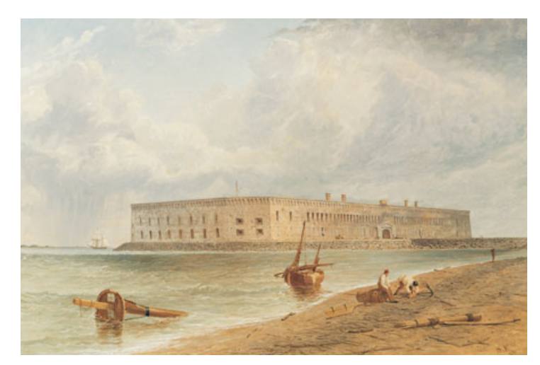
Fort Sumter, South Carolina (before the war) by Seth Eastman, 1871.

(House Fine Arts Board. Photo courtesy Architect of the Capitol)