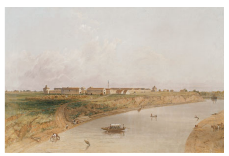
Fort Rice, North Dakota by Seth Eastman, 1873. (House Fine Arts Board.)