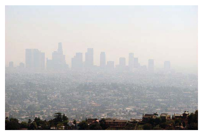
An example of poor urban air quality Los Angeles smog

ARL conducts research and development in the fields of air quality, atmospheric transport and dispersion, and climate change. Key capabilities include the development, evaluation, and application of air quality models; improvement of approaches for predicting atmospheric dispersion of hazardous chemicals and materials; and improved measurements and understanding of the exchange of material between the air and Earth's surface and climate variability and trends.