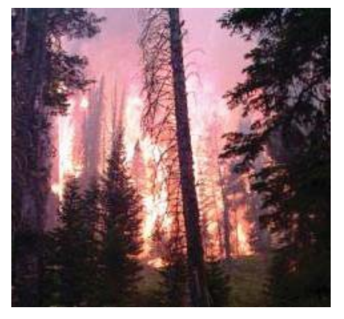
Forest fires release smoke and gases and chemicals, such as mercury, into the air.

ARL monitors and models air quality and deposition of pollutants to the Earth's surface to enhance assessments of changes in the atmospheric environment and to improve predictions of such changes. A primary focus of ARL's air quality research is on understanding the interaction between the atmosphere and the underlying land and water surfaces and biological systems.