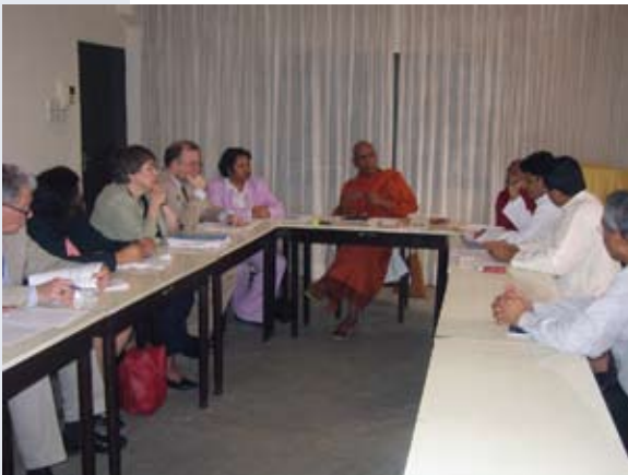
Commission meets with members of the Jathika Hela Urumaya (JHU) Party in Sri Lanka

In 2004, two draft laws purporting to restrict religious conversion and the act of attempting to convert another person were circulated in Sri Lanka. The first was a private member's bill drafted by the Jathika Hela Urumaya (JHU) party comprised of nationalist-minded Buddhist monks, targeting "forced" conversions; the second was a bill proposed by the government, a much stricter bill that essentially prohibited any and all attempts to convert another person—even inadvertently. In July 2004, the government's bill was sent to committee for re-drafting. The JHU bill was tabled that same month and sent for analysis on its constitutionality to the Supreme Court, where over 20 challenging petitions had been filed. In August 2004, Sri Lanka's Supreme Court ruled that certain clauses of the JHU bill violated several articles of the constitution. As a result of the Supreme Court's ruling, in order for it now to become law, the bill in its entire form would require a two-thirds majority in the parliament and the approval of the people of Sri Lanka in a referendum.