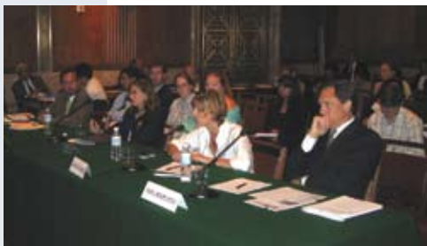
USCIRF Pakistan hearing

and they are reportedly subject to ill treatment from prison authorities and fellow prisoners. Because they are required to register to vote as non-Muslims, a policy that was reaffirmed by Pakistani government officials in February 2004, Ahmadis who refuse to disavow their claim to being Muslims are effectively disenfranchised. The one potentially positive development, the December 2004 abolition of the religion column in Pakistani passports, which, among other