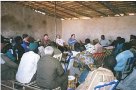
Commission at IDP Camp Jebel Aulia, Khartoum

Sudanese of all walks of life who met with the Commission delegation made clear that they want peace and are weary of the many conflicts that they have lived through since independence. One of the surest signs of the hunger for peace is that approximately 500,000 IDPs and 50,000 refugees already have returned to the South and transitional areas. Preparations are being made for still others to return home with assistance, an effort to which the United States is the largest contributor. Southerners living in Khartoum overwhelmingly told delegation members that they plan to return to the South, even those who had lived for many years in the North and had secure jobs.