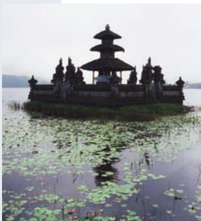
Temple in Bali

Attacks on Ahmadiyah religious communities followed the issuing of a fatwa in July 2005 by the Indonesian Ulema Council (MUI) condemning Ahmadiyahs as “deviants” from Islam. In addition to the Ahmadiyah fatwa , the MUI issued religious edicts banning interfaith prayer, marriage, and inheritance, as well as the notions of pluralism, liberalism, and secularism. According to Indonesian human rights groups, the MUI fatwas undermined public support for projects of interfaith dialogue and public discussions on the compatibility of Islam, democracy, and human rights. Intellectuals, scholars, and activists engaging in these activities have been intimidated and their lives and property threatened. Though the MUI is not a government entity and its fatwas do not carry the force of law, the Indonesian government has not publicly addressed the MUI edicts or distanced itself from their content. However, the Indonesian government has consistently refused calls for an outright ban on the Ahmadiyah religion and publicly supports constitutional guarantees to freedom of religion for that community.