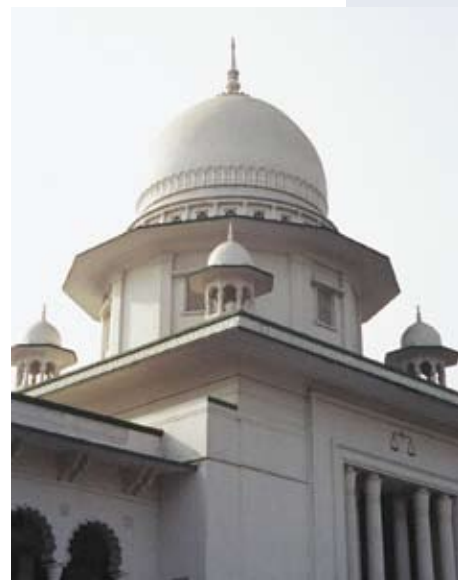
Supreme Court, Dhaka, Bangladesh

The Commission has met on a number of occasions with human rights monitors, representatives of religious communities, Bangladeshi diplomats, and others to discuss religious freedom in Bangladesh. In April 2004, the Commission, together with Congressman Joseph Crowley, a member of the House Committee on International Relations, held a public hearing at the City University of New York (CUNY) School of Law at Queens