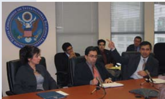
USCIRF roundtable on Iran

Non-Muslims may not engage in public religious expression and persuasion among Muslims; some also face restrictions on publishing religious material in Persian.