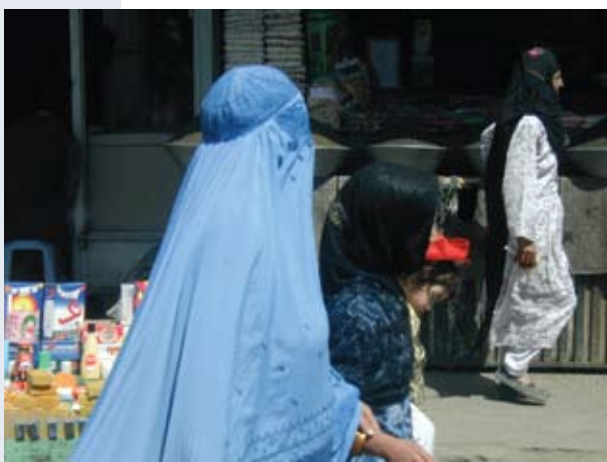
Afghan women in Kabul

he rejects three crucial freedoms—those of expression, religion, and equal rights for men and women—all of which are protected under the Universal Declaration of Human Rights. As a consequence of his actions, a sitting Minister in the interim Afghan government was forced to resign after she was charged with blasphemy for questioning the role of Islamic law in Afghanistan, journalists have been jailed on charges of offending Islam, and during the October 2004 presidential elections, a presidential candidate was threatened with disqualification for purported “anti-Islamic remarks” on women’s rights and family law. These incidents suggest that despite the gains since 2002 and the adoption of a new constitution, religious freedom and other human rights, along with democracy itself, remain under threat from extremism.