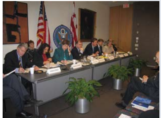
USCIRF Russia roundtable at Carnegie Endowment for International Peace in Washington

After the 2004 hostage-taking in Beslan, police actions against Muslims in the North Caucasus intensified. The Russian human rights group Memorial described most cases against Muslims in that region as "trumped-up." Nine female Muslim students at the Kabardino-Balkariya State University reportedly were detained in June 2005 and interrogated for wearing the hijab and engaging in group study of the Quran. Mosque closings in Nalchik in October 2005 resulted in violence in which some 300 attackers targeted military garrisons and police stations, leaving 34 police and armed forces members dead. Following this incident, police harassment of Muslim clerics and torture of alleged militants reportedly increased. According to the State Department, the head of the Islamic Research Institute in Nalchik, who sought to promote dialogue between the authorities and Muslims, is