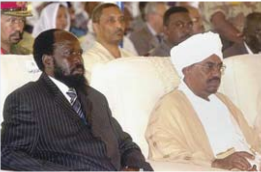
Sudan's First Vice President Salva Kiir and President Omar Bashir

The final resolution of a number of important issues has been left to an array of commissions and administrative arrangements. The Commission delegation learned that there have been significant delays and shortcomings in the implementation of the CPA. These developments raise questions regarding the sincerity of the commitment of the National Congress Party leadership, who still hold the major levers of power in the new Government of National Unity. Northern politicians have a long history of broken promises in respect to the rights of Southern Sudanese.