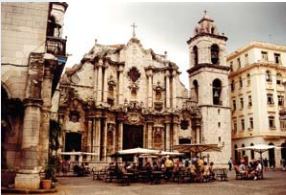
Cathedral in Havana

A new law went into effect in September 2005 requiring all house churches to register in order to legalize previously unauthorized groups. Put into effect as Directive 43 and Resolution 46, the new law has increased concerns primarily amongst Protestant religious groups, many of which hold unauthorized religious meetings in private homes several times per week. Once authorization is formally refused, the members of the house church are not permitted to meet at the same house. Reportedly, at least three Protestant house churches have been closed, confiscated, and/or demolished since the new law went into effect. However, there is no evidence that the new legislation has resulted in a wider crackdown on house churches thus far. In order to legalize a house church, the new law requires that there may be no more than three meetings at the house per week; the house church cannot be within two kilometers of another house church of the same denomination; and detailed information on the number of members, when services will be held, and the names and ages of the inhabitants of the house must be provided. The new requirements also prohibit the participation of non-Cubans without government permission and foreigners are prohibited altogether in the mountainous regions.