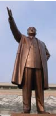
Kim Il Sung statue

The North Korean government forcefully propagates an ideology known as “ Juche ” or “ KimIlSungism ” centered on the personality cult surrounding Kim Il Sung and Kim Jong Il. Pictures of the “Great Leader” (Kim Il Sung) and the “Dear Leader” (Kim Jong Il) hang on the walls of every house, schoolroom, and workplace. The only exception is the churches of Pyongyang, where crosses hang in their place. Under threat of fines and other penalties, North Koreans are required properly to maintain and display the portraits of their leaders. Every North Korean wears a lapel pin of the Great Leader. Schools are required to study and memorize the “Ten Principles for the Establishment of the One-Ideology System of the Party.” North Korean refugees report that each village contains a “Kim Il Sung Research Center” where they are required to attend weekly meetings. One scholar estimated that there may be as many as 450,000 such centers, including one in the infamous Yodok prison camp. Meetings include watching inspirational films on the Dear Leader’s life, indoctrination sessions on the principles of Juche , and public self-criticism sessions.