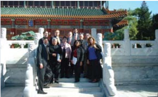
Zhongnanhai, where Chinese leaders live and work

The Commission appreciated the opportunity to gain familiarity with several places in China, including Xinjiang and Tibet, as well as the efforts of its Chinese hosts, the State Administration on Religious Affairs and the Ministry of Foreign Affairs, to arrange meetings with a range of senior national and local officials. Nevertheless, virtually all of the delegation's interactions and activities were monitored and controlled by government representatives.