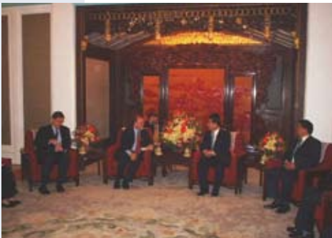
Commission meets with Chinese Vice Premier Hui Liangyu

After studying the matter, consulting with experts, and discussing the issue in China, the Commission concludes that the new regulations were issued in large measure to regularize the management of religious affairs, thus offering Party leaders more extensive control over all religious groups and their activities. Under the new rules, success with regard to implementation is measured according to the number and proportion of unregistered religious organizations and sites that local officials can succeed in bringing into the structure of officially registered religious groups. Any religious activity outside this official structure is illegal and subject to restriction. Local Religious Affairs Bureaus (RAB) pressure unregistered groups to become registered or to merge with existing registered groups. Groups that persistently resist pressure to register have been shut down and their leaders detained or fined, and in some cases, made to face criminal prosecution.