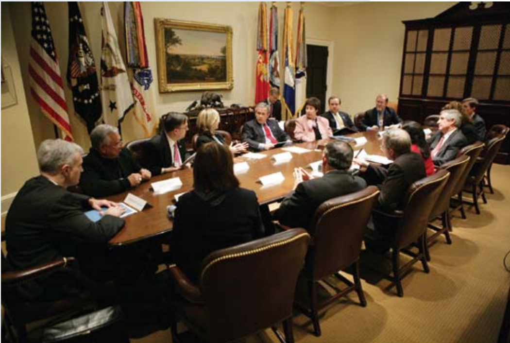
USCIRF meets with President George W. Bush